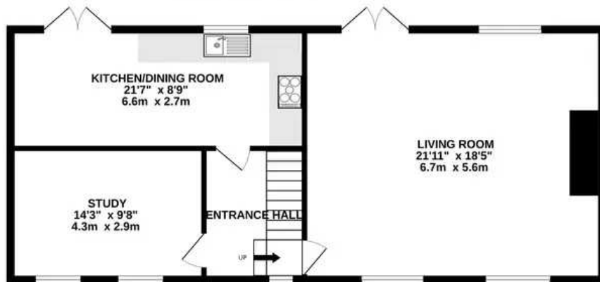
GROUND FLOOR 788 sq.ft. (73.2 sq.m.) approx.